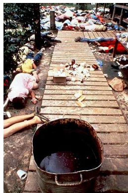
Bodies of members of the Peoples Temple who died after their leader Jim Jones ordered them to drink a cyanide-laced beverage. The metal wash pan contained the poison that they drank.

Jim Jones and hundreds of his followers emigrated to Guyana , West Indies, and set up an agricultural community called Jonestown in 1977. Jones became like a dictator and confiscated passports and millions of dollars from his followers, and manipulated his followers with threats of blackmail, beatings, and probable death. He also staged bizarre rehearsals for a ritual mass suicide. On November 18 he commanded his followers to drink cyanide-adulterated punch, an order that the vast majority of them passively and inexplicably obeyed. Jones himself died of a possible self-inflicted gunshot wound in the head. Guyanese troops reached Jonestown the next day, and the death toll of cultists was eventually placed at 913, including 276 children.