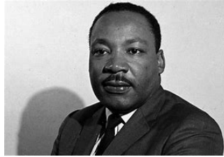
Martin Luther King Jr.