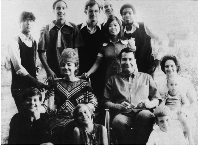
Portrait of American religious leader Jim Jones, the founder of the People's Temple, and his wife, Marceline Jones, seated in front of their adopted children and next to his sister-in-law (right) with her three children. (California, 1976).

and most importantly, he was accused of illegally diverting the income of cult members to his own use.