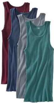
Marina ribbed undershirt

It is because of these situations that Sanda Marina, the Intermittent/Interloper Devel who came to know about their existence, as she goes into their brain and body to search. Every man, penis one is to wear a “Marina” undershirt under their shirt to protect them against the Sanda Marina devel. The Marina undershirt has protection in it especially for the male types. The marina has a ribbed stretchable material that is not elastic. The marina is not to be white, green or cream color. It should be black, red blue, etc. There is also a marina type brief underwear to protect the cocky and the batty from Sanda Marina as well. Women can wear the Marina undershirt as well for protection.