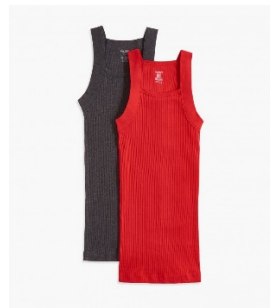
square cut Marina