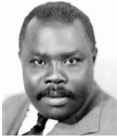
Marcus Mosiah Garvey

September 11, 2001 and before. Mark Hatfield right and legal name outside this Earth is: Marcus Moses Garvey. He calls himself as well Marcus Mosiah Garvey, He likes transportation, as he was in the Black Star Line shipping business during the reign of terror of Marcus Garvey. I asked Marcus Garvey of Jamaica if he is a plastic man, and he said yes. He is held as a hero in Jamaica, as they do not know the history of those who are Heroes as the present population have not lived as long as those reported days of heroism. The stories we know did not happen as they are told.