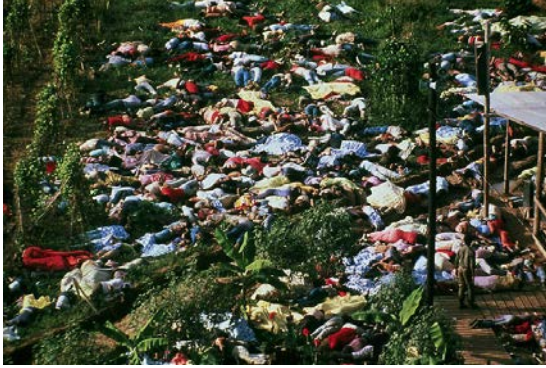
Dead bodies litter the ground after a mass suicide of the People's Temple cult followers.

It is reported that Jim Jones compared his beliefs and activities to the likes of Vladimir Lenin of Russia and Jesus Christ, the Barak Obama of unknown history. Mark Hatfield, Jim Jones, Marcus Garvey, Bill DeBlasio, and his other names can be of any color, any size, shape, and height. He can be Black or soft pink or brown or a mixture of brown and soft pink in color, and he can also be Indian looking and short, tall, stocky sometimes thin looking. The most you will see him looking is a thick tough, hog head looking man with very round toe shoes. He likes to be tall and he can seem intelligent as he has many of our lives in him and he uses dead PhDs thinking and speech boxes to make himself seen as intellectual and charismatic to draw interest. Whenever he is thin looking, he gives his wife or one of his other forms the many creations he uses inside of him as power and energy. Mark Hatfield and his wife transfer between thickness as he can appear thicker some days and thinner some days. They have many of the Inerlopeans esistences in them and many chreations and other esistences they have stolen.