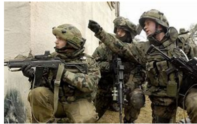
US Military in Action