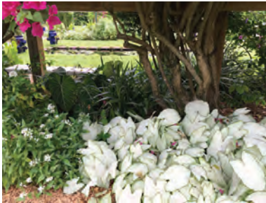
White caladium called Moonlight