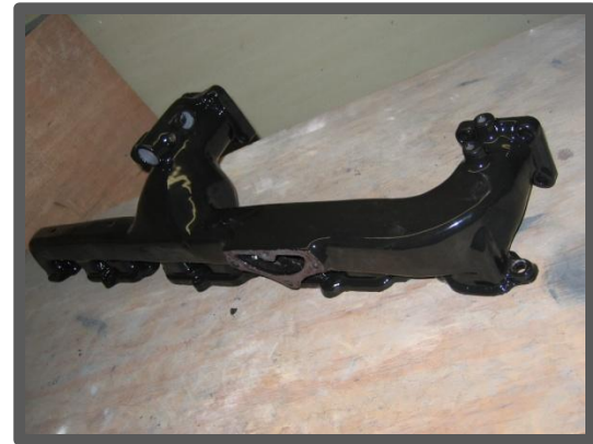
Post-repair and with new porcelain coating

The repair process involved magnafluxing the manifold to identify all cracks which may be in need of repair. They then secure the manifold to a fixture to ensure that it does not warp throughout the actual welding process. The manifold is placed in an oven and heated to cherry red (about 1200° F ), and then cast iron is flowed into the repair areas. A lengthy cool down period follows the repair. After repair, the flange areas are machined.