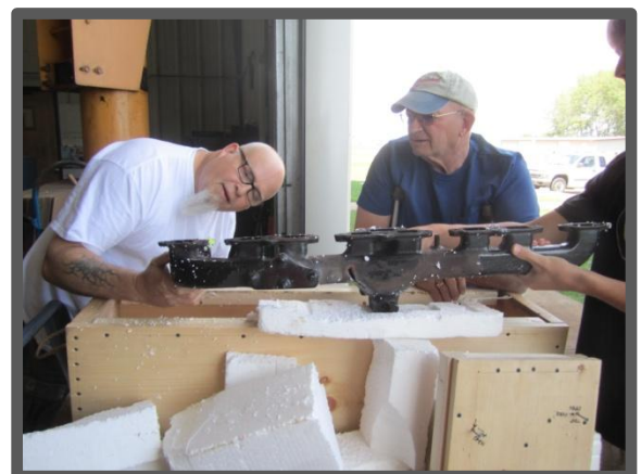
Manifold inspection in Nevada, IA

Packard Motor Car Company... the original... new... building... the... heat steel