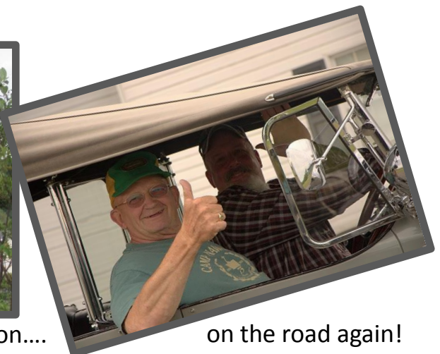
on the road again!