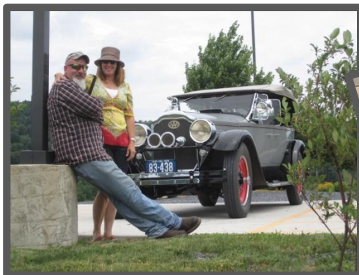
Subject 1926 Packard 236 Phaeton....