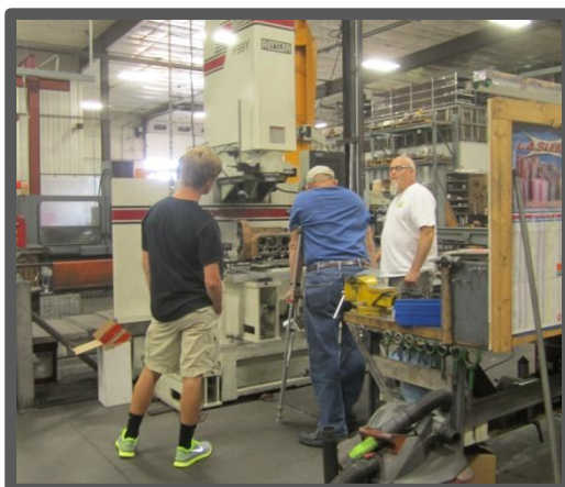
Midwest Cylinder Head Shop Tour

great shop which can do these repairs using cast iron, and successfully re-porcelain the result. Call Midwest Cylinder Head and Machine in Nevada IA." And in this millennium of new media, they even are on YouTube!! Concerned about the ultimate result and the capabilities of Midwest, we decided to take the manifold to Iowa for a face-to-face and a shop tour... and after Galena, everybody needs (another?) road trip to Iowa!