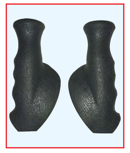
Soft ergonomic handgrips