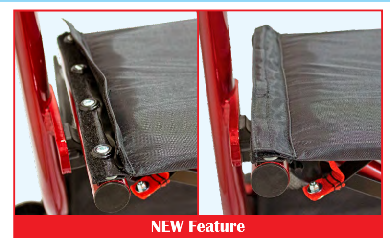
Padded seat has velcro flaps to cover screws