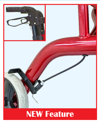
Cable inside frame