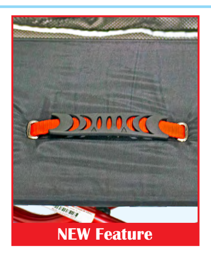
Improved latch handle