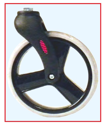
Front wheel reflectors