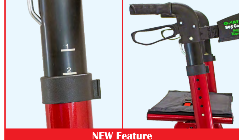
Push button height adjustment with markings for height