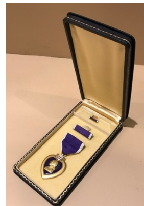
Peregory's Purple Heart