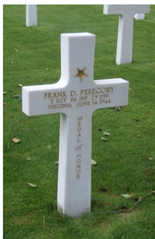
Peregory's gravestone.

It is an honor and a privilege to remember Frank Peregory, and the men who served under “the Blue and the Gray” in World War II. Ever Forward.