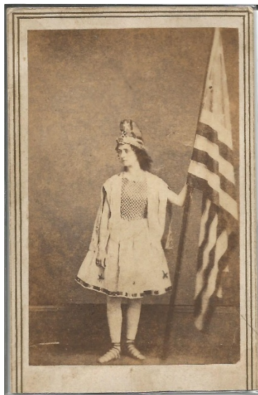
The Vision Of A Unified Nation

A crowd of some 20,000 gather at the East Portico to hear the new President deliver his inaugural address, an abbreviated and largely perfunctory effort of only 1090 words.