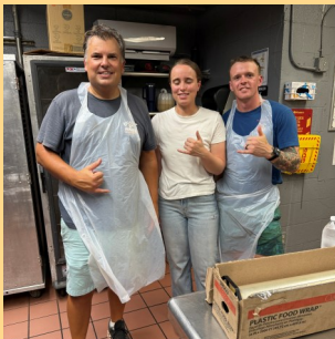
October 6th IHS Ministry Serving