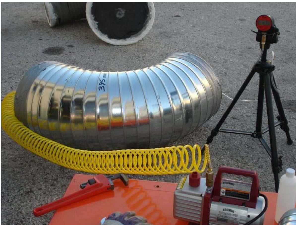
Figure 1 Typical Test Setup, 15.6 in. (395 mm) Elbow Shown

See Figure 1 for a picture of the typical test setup.