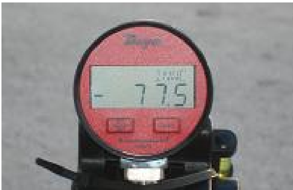
Figure 3 Pressure Gauge used to Measure Negative Pressure