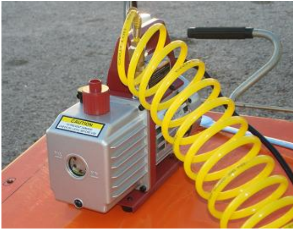
Figure 2 Vacuum Pump used to Evacuate Air from Each Elbow

The equipment used for testing is shown in greater detail in Figure 2 and Figure 3 . In Figure 2 , a picture is shown of the vacuum pump used to evacuate air from each elbow. In Figure 3 , a picture is shown of the digital pressure gauge used to measure negative pressure.