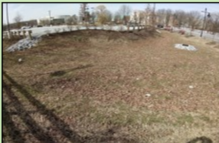
Bio-retention basin that is routinely mowed.

These are examples of items to discuss with your plan designer so that you have success as your project transitions to a long-term operation and maintenance schedule. This schedule is critical to the function of your stormwater facility as well as to the cost of it. Far too often we see landowners or property managers mowing bio-retention basins on a weekly or bi-weekly interval. This takes time if you do it yourself or costs money if you are paying someone else. A typical bio-retention mowing schedule prescribes mowing twice per year in the basin bottom - once in the spring and once in the fall after plants have gone to seed. Constantly having a mower on the basin bottom can also lead to compaction of the porous soils that are needed to help soak up, infiltrate, and evapotranspire the stormwater runoff. Minimizing compaction of the bottom and allowing more robust root systems to take hold in the soil also helps to minimize the risk of the stormwater facility failing to operate as it was designed. Otherwise you may have to hire someone to come fix it. So, plan accordingly and mow your basin less, it only makes "cents."