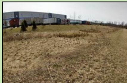
Bio-retention basin naturalizing with infrequent mowing.