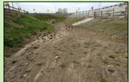
Erosion from lack of stabilization measures between plugs.