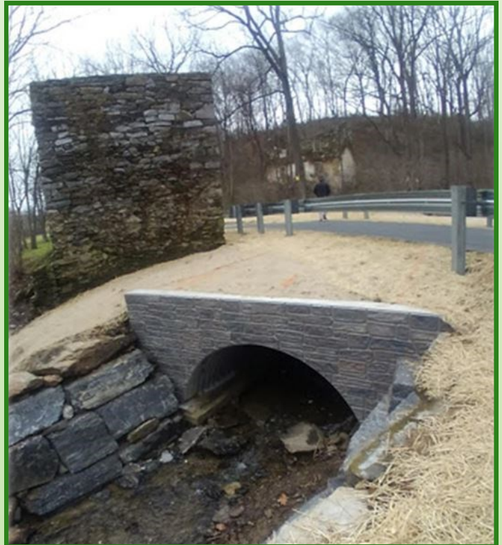
Runnymede Road – West Marlborough Township