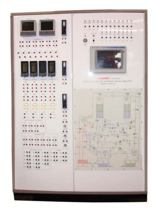
H-IPPT-3X Industrial Process Plant Trainer (with Cabinet Control Panel)