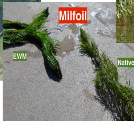
Identification of native and Eurasian water milfoil