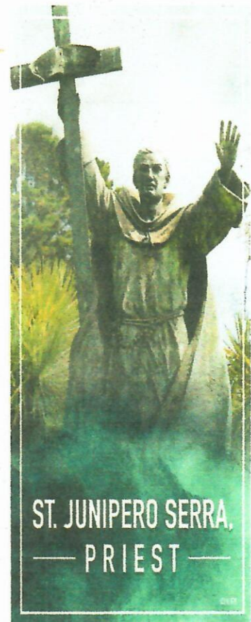
ST. JUNIPERO SERRA, — PRIEST —

"Do not be afraid, just have faith." God does not rejoice in our demise or our destruction. Rather, He made us in his image and desires that we have life. He also desires that we be healed and know His loving touch. There is great power in an embrace offered in love. The touch of another can heal wounds and restore life. There is also power in faith. Faith can turn us toward the truth and turn us toward God. Both love and faith can lead us to hope that no matter what we encounter, God will continue to sustain us in being. He will not allow us to perish. God can profoundly change how we see Him, ourselves, and one another. God desires that we turn toward Him and be healed of all that wounds and binds us so that we can be free and enjoy the fullness of life. We are asked to arise and walk proudly with this life-giving faith. Reach out and share this faith with someone this week so that they too can receive God's life changing embrace and heed His call to wholeness. There are many in our world wandering around aimlessly without hope. Bring it to them.