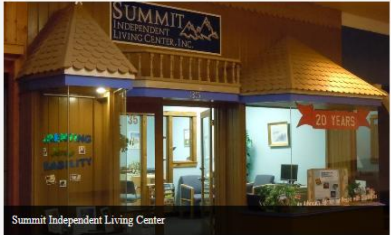
Summit Independent Living Center