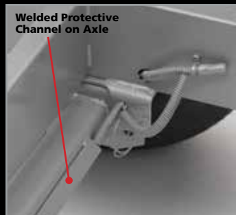
SmartWire™ Technology (12V)