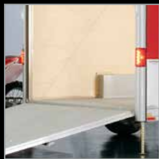
Standard SmartFrame™ Design*