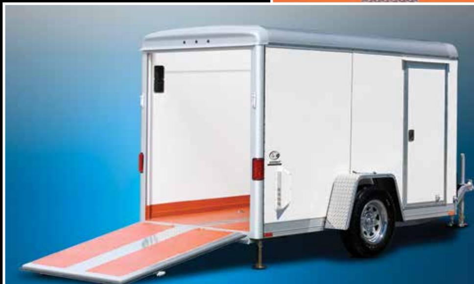
Exterior - Badlands Package