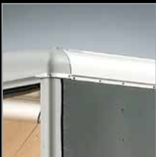
Radius Roof & Extruded Cove