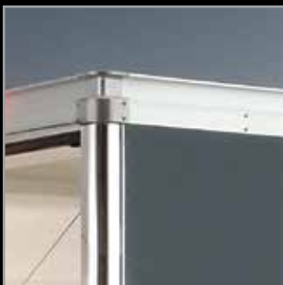
Flat Roof with Extruded Trim