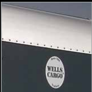
Stainless Steel Front Cap