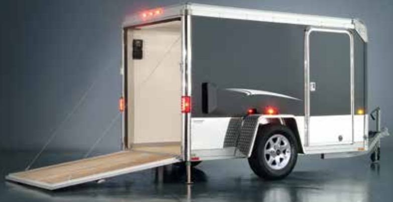
MC101-5 ME (featuring optional Signature Package)