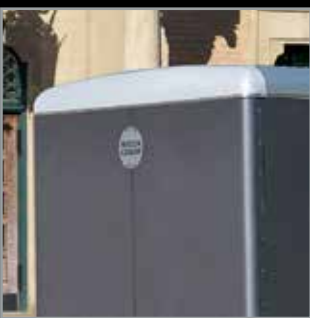
Fiberglass End Caps