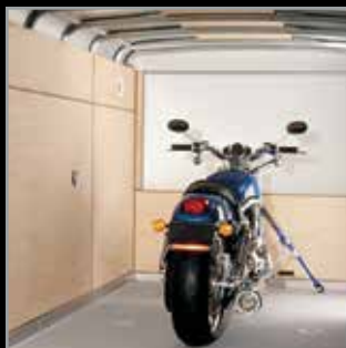
Standard TE Interior