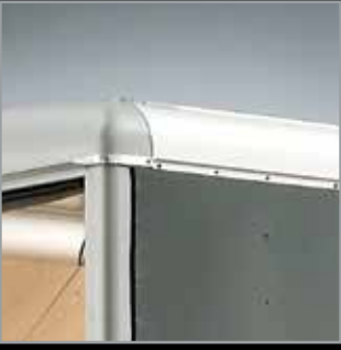
Radius Roof & Extruded Cove