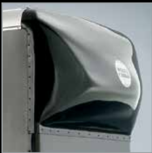
Aerodynamic Nose Cone®

If cookie-cutter trailers don't cut it with you, then the Wells Cargo cycleWagon® TE (Touring Edition) is your kind of motorcycle trailer. Outside, the aerodynamic Nose Cone® makes a strong first impression, plus it delivers superior handling and improved fuel economy. Inside, you'll find all the necessities for a first-class travel experience for your motorcycle. No worries. No hassles. This unique blend of form and function makes the TE Series the clear leader of the pack.