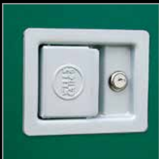
Rotary Style Flush Lock