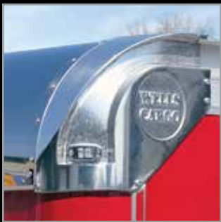
Cast Aluminum Front Cap