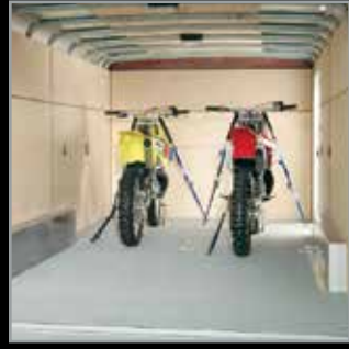
Standard SE Interior