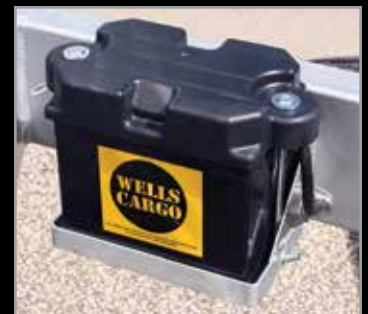
Wet Cell Battery to D.O.T. Standards