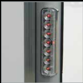
LED Exterior Lighting

Solid engineering delivers solid performance. Even though a motorcycle trailer may be considered a “recreational” trailer by some, the cycleWagon® has the same backbone and rugged heritage as our commercial grade trailers. You can tell by our advanced design, top-notch components, and detailed “fit & finish” that we’re serious about our position as the industry leader. This focus on quality means you’ll run out of adventures long before your cycleWagon® is ready to call it quits.