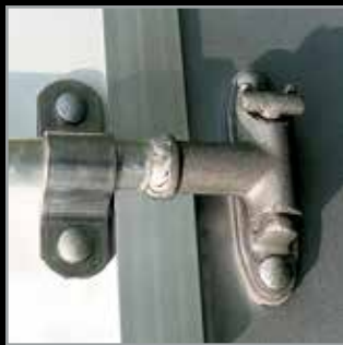
Aluminum Anti-Rack Cam Lock