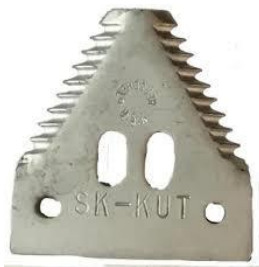
SCH 4498SK2 $ 1.60 EA.