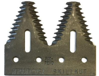
JD (600 SER.) 9531SK2 (BLACK) $ 2.10 EA.