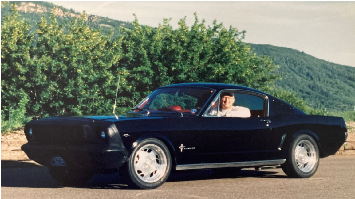
1965 Fastback in the early 90s.