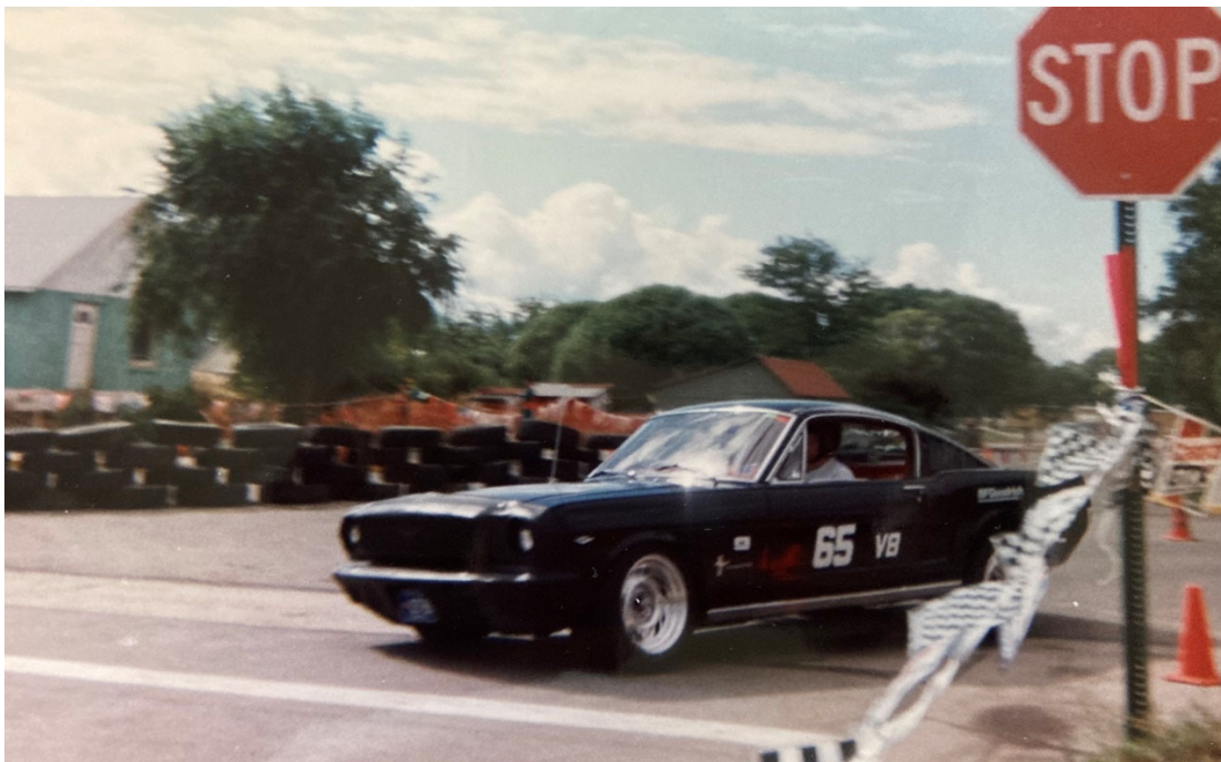
Autocross at Parachute, Colorado