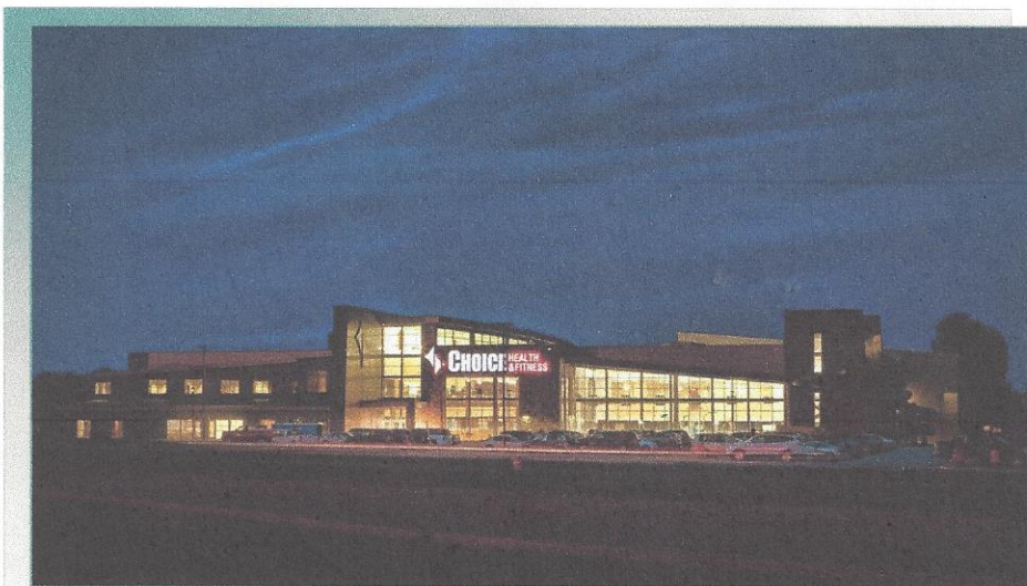
Grand Forks, North Dakota