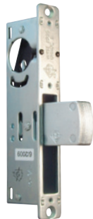
LONG THROW DEADLOCK (A)