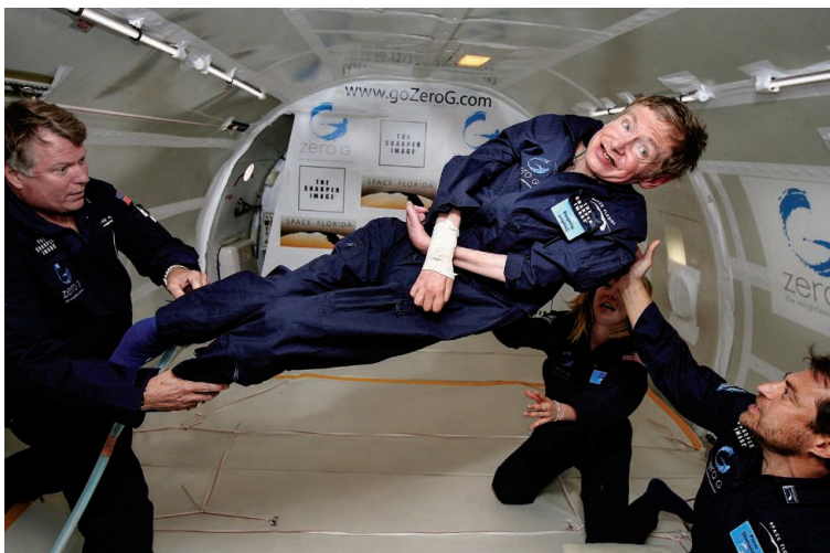
Hawking enjoys a moment of weightlessness in zero gravity in 2007.

Hawking was well known for two additional reasons unrelated to his mind-boggling cosmological theories. The first was his 1988 book, A Brief History of Time , an international bestseller that sought to explain the physics of time to the general reader without using mathematical equations. The second was his courageous struggle with motor neuron disease, which rendered him wheelchair-bound and dependent on a computer screen and speech synthesizer to communicate. “[A]s someone who at the age of twenty-one was told by their doctors that they had only five years to live, and who turned seventy-six in 2018, I am an expert on time in an-