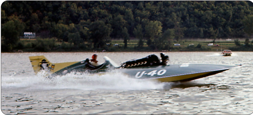
TOP: Puffs of black smoke shoot from the stacks of both Bardahl and Exide as their drivers apply nitrous oxide to the engines. ABOVE: Miss Bardahl in Madison, Indiana.