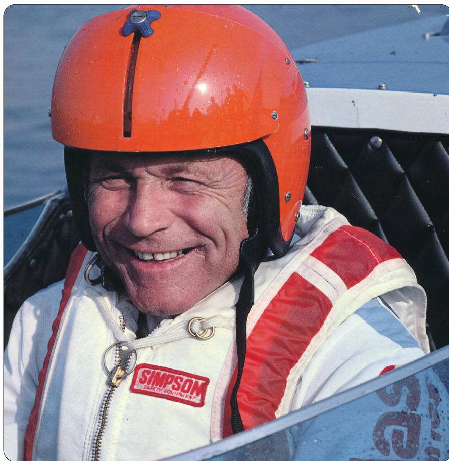
Hydroplane and Raceboat Museum

The search didn't take long. By simply turning on the radio, I soon heard the news bulletins that the rumors were true. Bill Muncey had been killed.