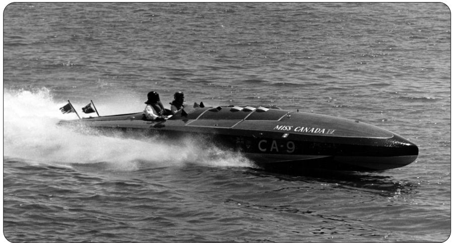
Hydroplane and Raceboat Museum