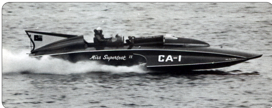
The Miss Supertest II with a tail fin and dropped sponsons.

causing problems. We were getting to know pretty well what we could do and what we couldn't do. She ran very well that day. That was good fun. That was a good race. I think everybody enjoyed it.