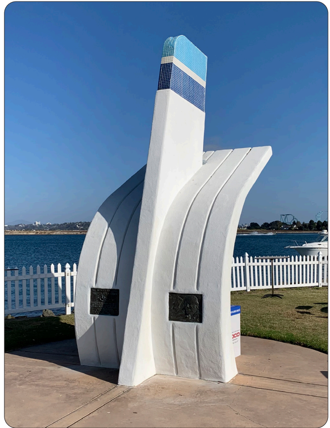
A memorial to Bill Muncey stands on East Vacation Island in San Diego, adjacent to the pit area that is used for today's Unlimited races.

Park. There, with full military honors, the most famous race boat driver in the world was laid to rest 40 years ago this month on a grassy hillside that overlooks the city. ❖