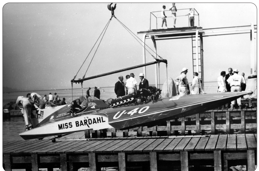
The Miss Bardahl on the sling at Seattle

Answer: Add more oxygen, because it is the burning of fuel and oxygen that produces the power in a piston engine. Air is about 21% oxygen; the rest is nitrogen and small amounts of other gasses. But nitrous oxide is about 37% oxygen, and oxygen is what we need! So,