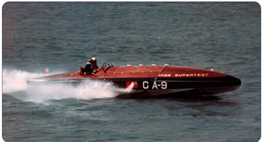
Hydroplane and Raceboat Museum