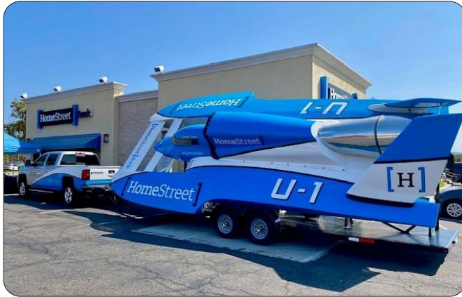
San Diego Bayfair

After having the Miss HomeStreet display hull out in the Seattle area last month to help promote Seafair community events, the display boat headed to San Diego (below) in advance of the H1 fleet. The hull went on display at HomeStreet Bank branches around the Mission Bay area and in San Diego County.