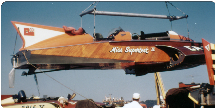
Hydroplane and Raceboat Museum