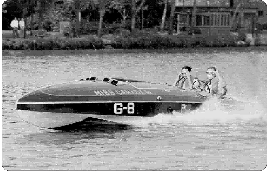
Hydroplane and Raceboat Museum