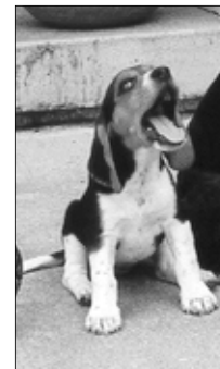
Distraction Number Two

And finally, the upcoming Chadwick Enduro. It's coming along. We have the course laid out. The women's and kids' loop is approximately 16 miles. The C riders have about 40 miles to go, the B course is just over 50 and the A loop is about 65 miles. It should be fun.