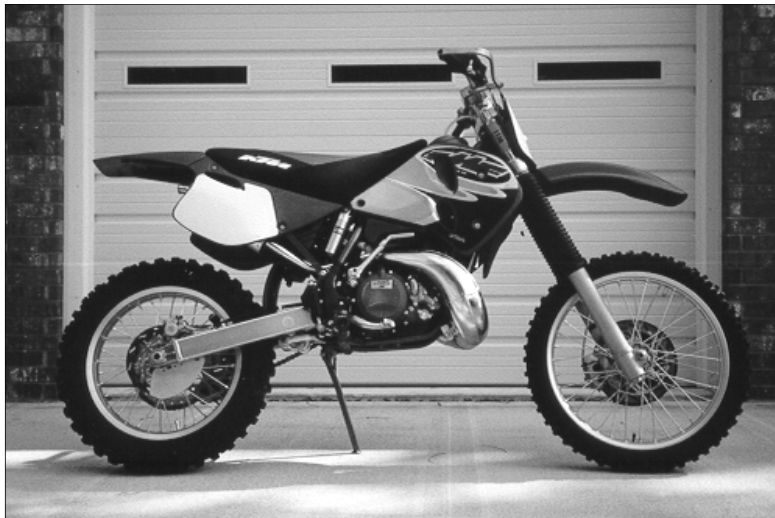
Distraction Number One.

A few things have conspired against me getting this newsletter out. First off, I got a new bike, a brand new 1997 KTM ECX 250. This is not a bad thing. It just takes time to get it set up. If you are wondering why a 97 model, because it is big. Being six foot four, this is something I look for, but I still had to make it bigger. I have already changed bar mounts so they are taller and further forward. I also put a taller seat on it. Two inches taller than stock! So it kind of looks like I set a couch on it. I also put purple plastic and new graphics on it. And some Flatland Racing Guards. It does look good. I got a lot of nice complements on it at Muskogee. In fact, a couple that were trail riding at Gruber on Saturday came up and took pictures of it!