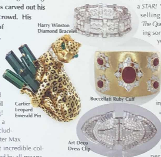
Harry Winston Diamond Bracelet

Stop by and take a peek into the world of the Dina Collection . This amazing wonderland of incredible is fit for 'Little Miss Sunshine'!