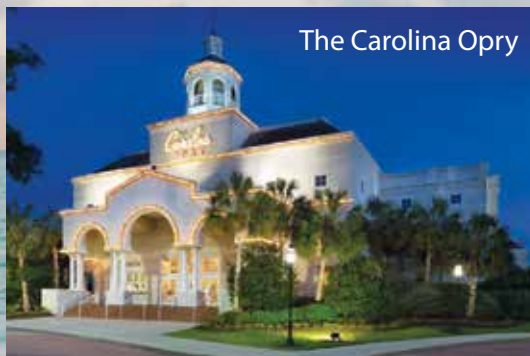
The Carolina Opry