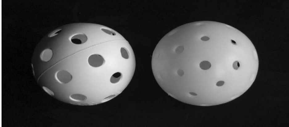
Figure 2-2. The Ball.

The ball pictured on the left of Figure 2-2 is customarily used for indoor play and the ball pictured on the right is customarily used for outdoor play. However, all approved balls are acceptable for indoor or outdoor play. The complete list of approved balls is on the IFP website.