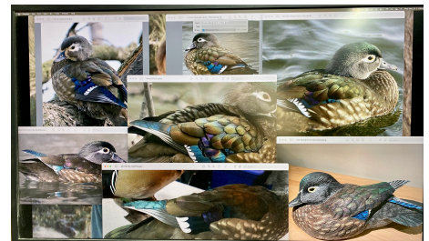
My monitor with reference photos while carving and painting a wood duck hen.

A very critical part of being a wildfowl artist. You can't make a duck look real if you don't know what a real duck looks like. The closer you look, the more you see. So the more info you can get on each bird the better your end product will be. The other part of reference is the 'how to' side. Learn from the experts. Fortunately there is a lot of good material available to give you step by step guidance on carving and painting. I've listed some of those that I have found most helpful.