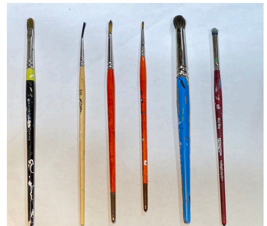
Left to right #6 Cats paw or filbert, 0/5 liner, #2 Raphael Round, 2/0 Raphael round, Large and small blending brushes.

Air Brush - is a whole other art form and should be avoided by the beginning carver. At some point you will want to try your luck, and amazing results can be achieved, but control is a real challenge. When you are ready, some lessons from a pro would be worth while.