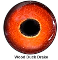
Wood Duck Drake

Glass eyes are available from many sources, but the best eyes aren't just a single color of red, brown, yellow, etc. they are blended colors or banded with a darker circle around the edge. The eyes make a big difference in the finished bird so spend a little more. Eyes run from $3 to $13 per pair. World class eyes are available from Tohickon eyes. Buy them from either tohickon.com or GregDorrance.com . There is a new source for eyes, Fulix.com . by carver Michael R Braun. His eyes look great, with more detail going into each species. They are priced at only $6.00 per pair. fulix365.com