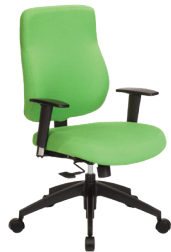
AD-H A : 20" C : 17" - 22" E : 21"