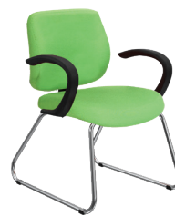
AD-L-3 A : 20" C : 18" E : 16"