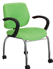
AD-L-4 A : 20" C : 18" E : 16"