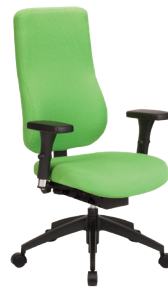
AD-D A : 20" C : 17" - 22" E : 27"