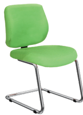
AD-L-2 A : 20" C : 18" E : 16"