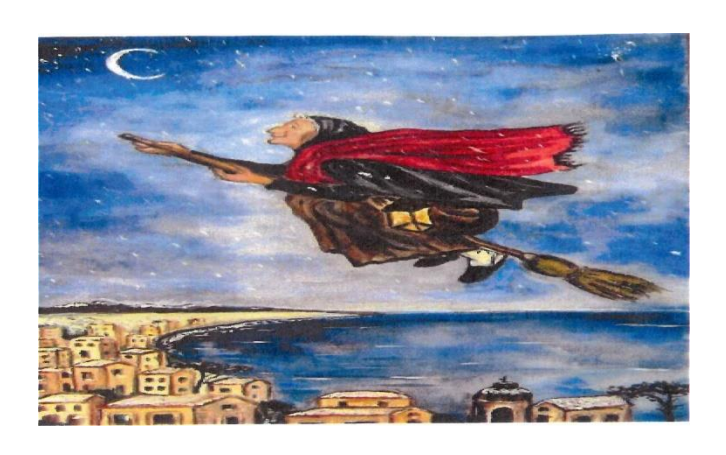
La Befana, An Italian Christmas Tradition

La Befana Vien di notte con le scarpe tutte rotte, col vestito alla romana viva viva La Befana! The Christmas season in Italy is one that begins with the Novena eight days before Christmas and lasts until the Feast of the Epiphany on January 6th.