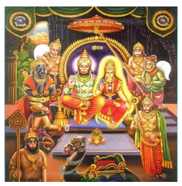
Sri Sai Hanuman Suvarchala Yagnam Monday, May 15<sup>th</sup> to Sunday, May 21<sup>st</sup>

Memorial day Long Weekend Program Saturday May 27th - Monday, 29th 2017 Temple Timings 8 am - 8.30 pm