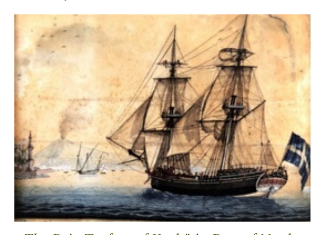
The Brig Trofast of Kaskö in Port of Naples 12/3/1795.

Various kinds of ships for use in trade were built along the coast. The forests offered tall pines for boards and masts for ships, and tar essential for sealing and caulking the wooden ships. In the era of world-wide need for tar for wooden ships, especially for Great Britain's extensive navy, tar became the main export which created wealth for the traders and shipping industry.