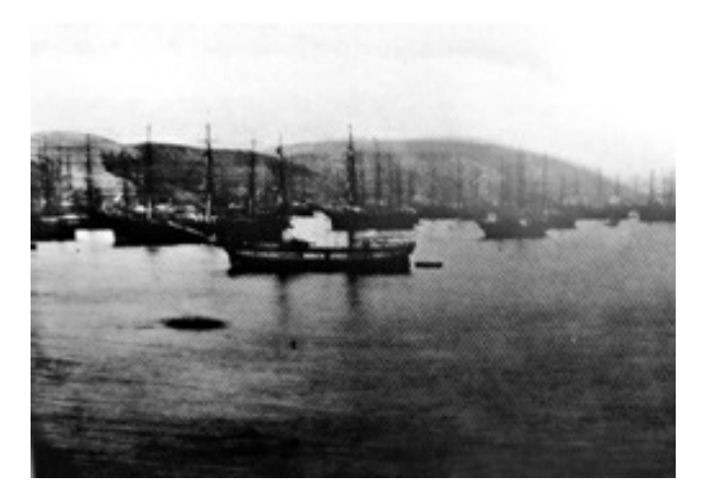
Ships waiting for a guano load at the Chinca Island in Peru in the mid 1850's. Waiting times were up to one year.

Thus, it was up to the ship's master to find opportunities to buy goods to be shipped to some other part of the world and sell them where he could get the best price. For instance, after having received a lucrative cargo from England to Australia, the captain then had to decide on their own to continue the ship's sailing from there.