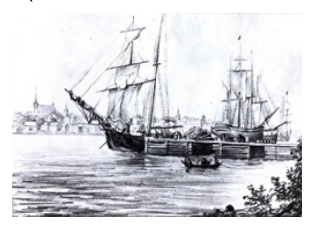
Kristinestad harbor in the 1840's. Pencil drawing by Johan Knutsson.

Ships have been built in Finland since early times, especially in Ostrobothnia. As the eastern half of the Swedish Kingdom from the 11th century until 1809, Finland was essentially an island with all trade and travel directed to Sweden. The Gulf of Bothnia and the Baltic connected both halves of the realm. It was easy to transport everything in ships across the sea, and inland by boat along rivers and lakes. Finland was covered with a dense primeval forest that divided rather than connected. The only land transportation means was on horseback or on carts pulled by horses or oxen along primitive roads built to connect fortresses in southern Finland, from Turku to Hämeenlinna Castle (Tavastehus) and the King's Road (Kuninkaantie - Kungsvägen) from Turku to Viipuri Castle.