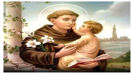
St. Anthony ~ Browns Valley