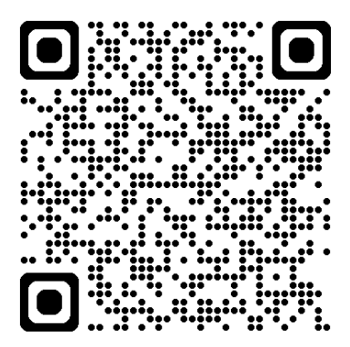
Books and Website – Concept Presentation (2022)