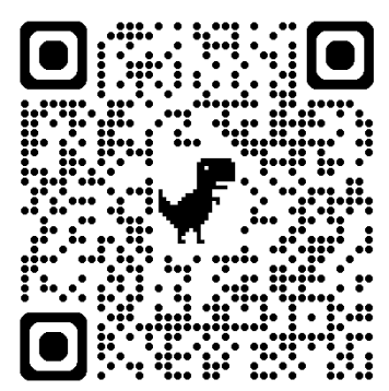
Website – Student Presentation (USA)