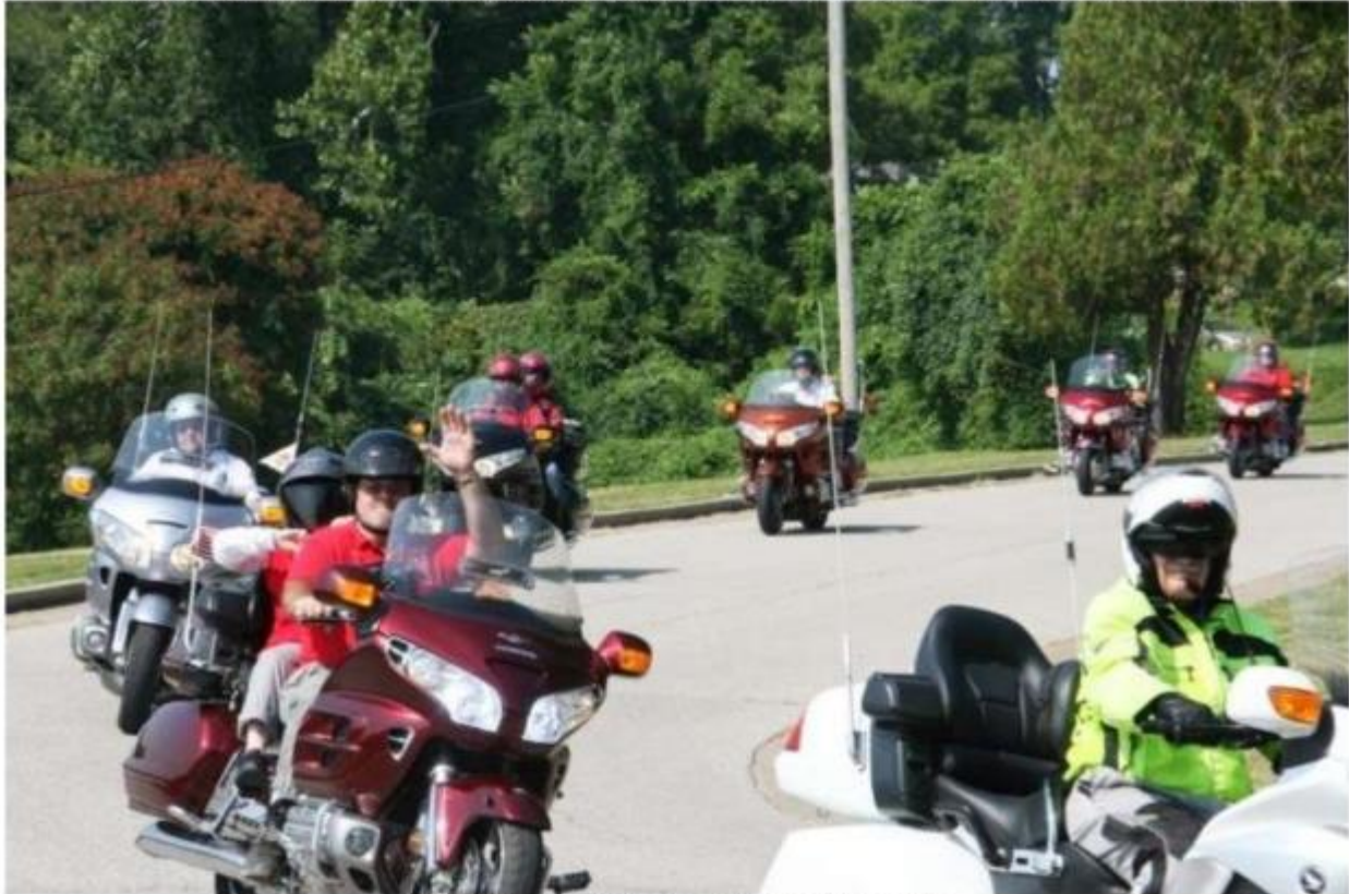
Guided ride through the beautiful Ozark Mountains