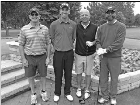
Pain Consultants Team 2