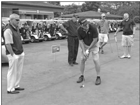
Putting Contest Sponsored by Covenant Hospital Medicine