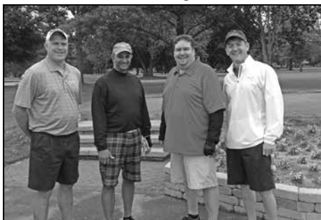
Mid-Michigan Surgical Team