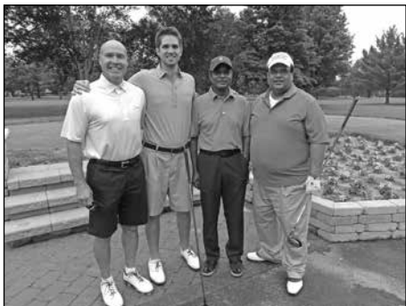
Pain Consultants Team 1