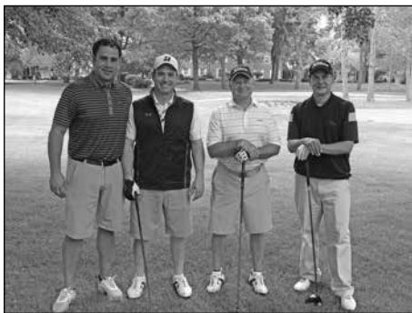
CMU Health Team