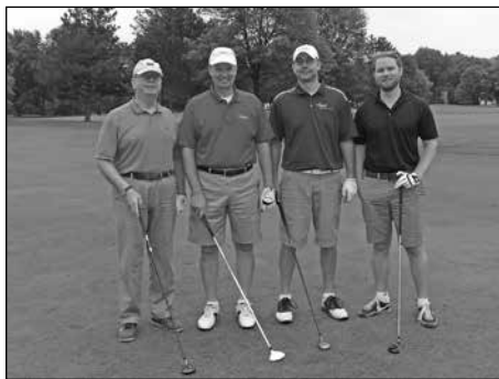
Covenant Medical Group Team

Mark your calendar for the 7th Annual SCMS Foundation Golf Outing on Saturday, June 11, 2016