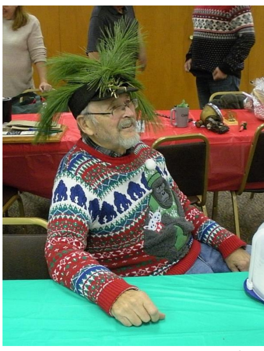
Ever wear a pine tree? Many parts are fashionable!