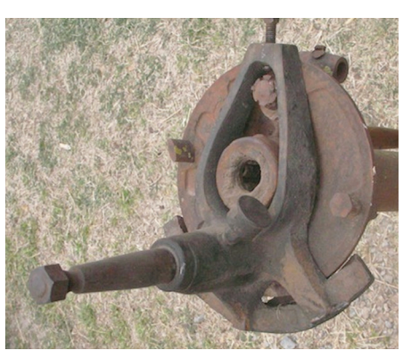
...then the Ekern emergency axle is just what you need!