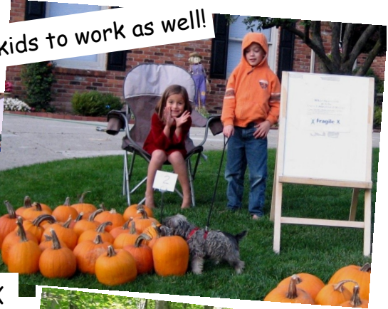
We put our kids to work as well!