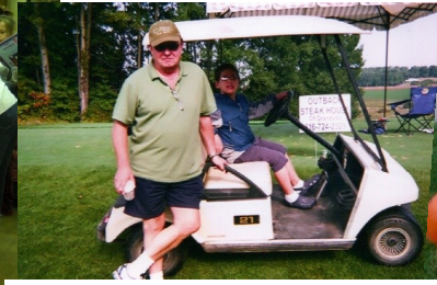
We Golfed! Fore Fragile X