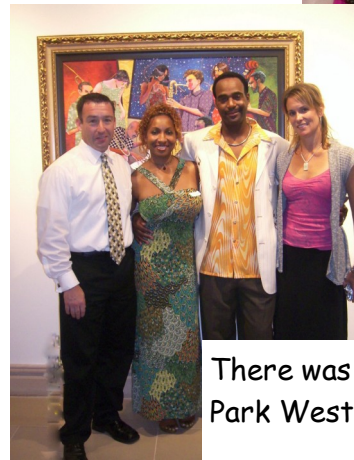
There was Art and Music! Park West Gallery, Southfield, MI