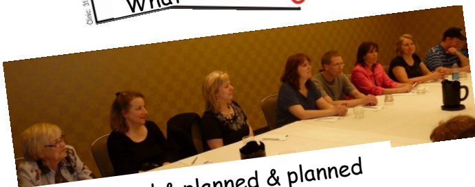
We planned & planned & planned