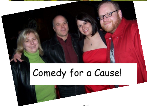
Comedy for a Cause!