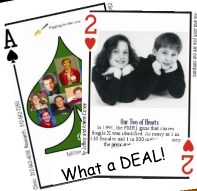
What a DEAL!