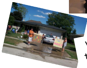
Working at the carwash!