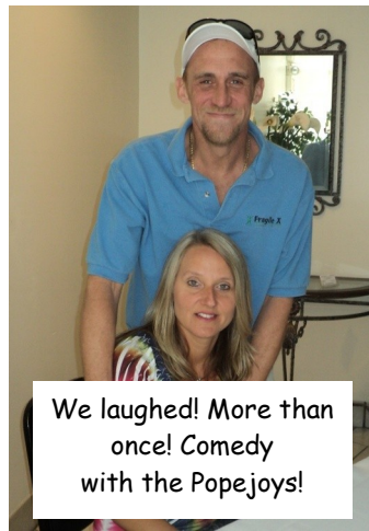
We laughed! More than once! Comedy with the Popejoys!