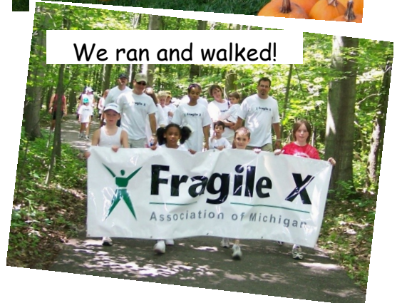
We ran and walked!