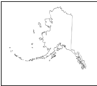
Exhibit A - Map of Regions