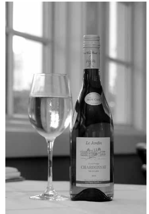
Le Jardin Cuvée Prestige

Le Jardin Cuvée Prestige is now available by glass and bottle to restaurant guests and will also sell retail by the case or bottle. The Bijou Cafe is located at 1287 First Street, Sarasota. Call 941-366-8111 or visit www.bijoucafe.net .