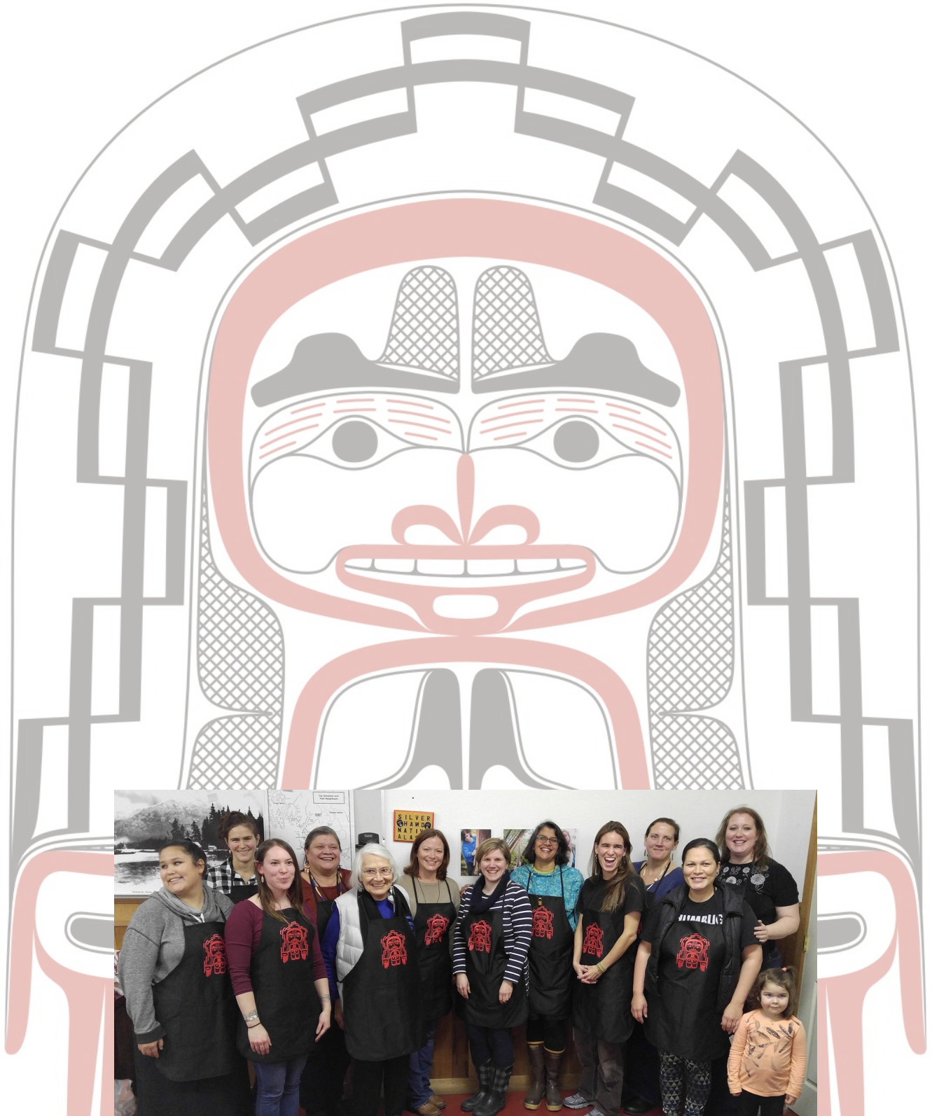
Students, teachers and museum staff wearing their Annette Island Weaving Society aprons after completing the Annette Island Tsimshian basket weaving class in Metlakatla, Alaska.