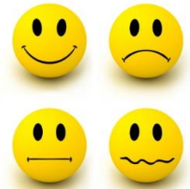
Spanish for the 3s & 4s

This month in Spanish we continued to learn about feelings-sentimientos. We sing the song "If you're happy and you know it..." in Spanish and change the feelings to Happy-Feliz, Mad-Enojado, Sad-Triste, Silly-Tonto with coordinating body movements for each; Clap, Stomp, Cry and Shout. The kids get excited every time we sing it!!! As we wrap up feelings, we begin our next lesson on daily routines; wake up in the morning and get out of bed-me despierto y me levanto de la cama; I put on my shirts and socks-Me pongo la camisa y los calcetines. Toward the end of the month we will start learning the names for all types of animals. We continue to review colors, body parts (we dance the Hokey Pokey in Spanish!), food, numbers, days of the week and the weather monkey.