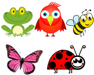
Creative Movement 2s, 3s, & 4s