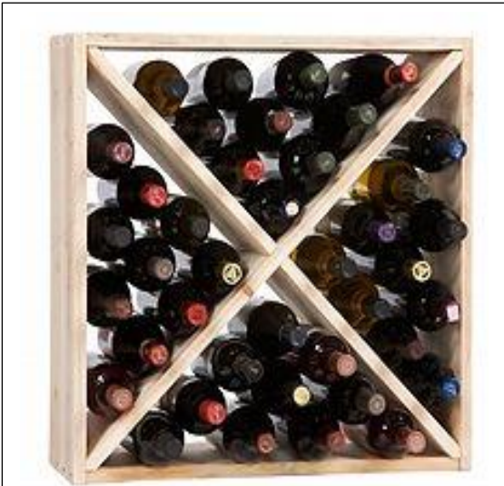
100 Bottles of Wine Raffle