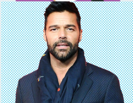
Ricky Martin, Singer/Actor

Alex Vega: "I don't need your help. I prefer to make my own cupcakes."