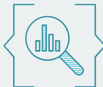
Learner & Instructor Analytics