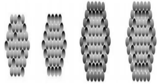
Fig. Different Structures of bimetallic nanoparticles Supriya Devarajan used N,N-[3-(trimethoxysilyl)propyl]diethylenetriamine (TPDT), tetraethoxysilane (TEOS), chloroauric acid, palladium chloride, silver nitrate, chloroplatinic acid, sodium borohydride, and methanol for the preparation of different structures of bimetallic nanoparticles. Double-distilled water was used in Brust process. Ethylene glycol was used as a solvent in case of polyol process.

BMNP are the 2 metals combination in the range of nanoscale size. This nano science region is gaining mounting awareness in the area of catalysis because of its effects of synergy. BMNP have 4 kinds of mixing prototypes: nanoparticles of core-shell, nanoparticles of sub- cluster, multi-shell nanoparticles as well as mixed (alloy) nanoparticles. Coreshell nanoparticles contain a shell of one atom type surrounding a core of another atom type as shown in Fig. 1.