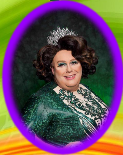
Eudora Riverz Princess Royal 31