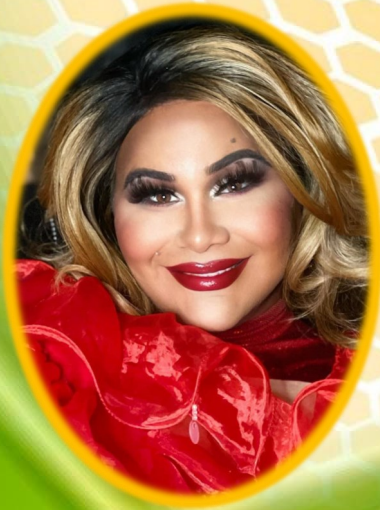
Dominique Cass Archduchess