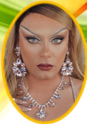
Nostalgia Taylor Countess