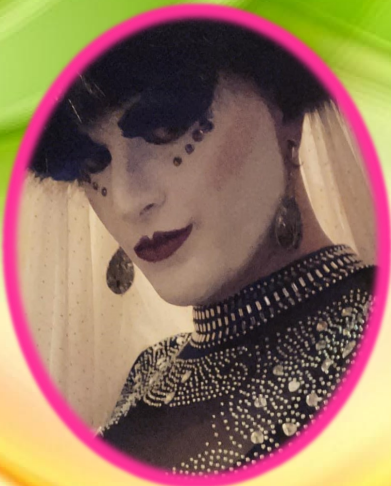
Chastity Locke Baroness