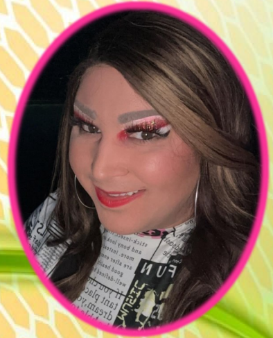
Marsha Mellow Monroe Viscountess