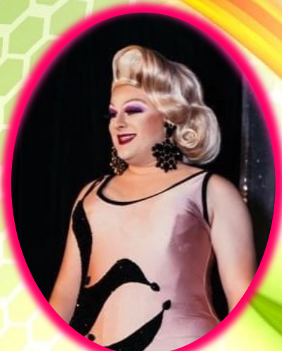
Eva Rose Princess