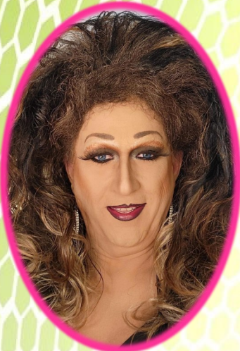
Topaz Stahr Princess