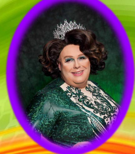
Eudora Riverz Princess Royal 31