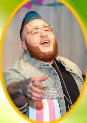
Miles Long Frost Prince