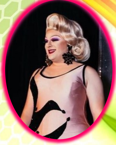
Eva Rose Princess