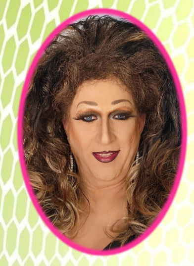
Topaz Stahr Princess