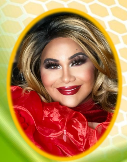
Dominique Cass Archduchess