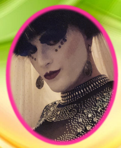
Chastity Locke Baroness