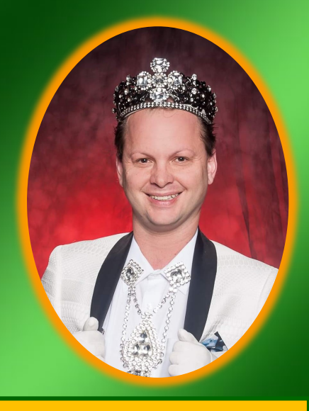
Treasurer Empress 25 & Emperor 29 Evian/Evan Waters