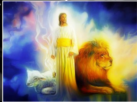
Yeshua ben Joseph and Yeshua ben David.

Astronomically, there are 3 constellations ruled by Leo that completes this picture of prophecy and the Genesis 3:15 issue.