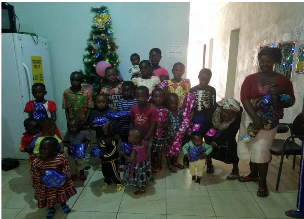
Children received toys during the 2020 Christmas event at GGH