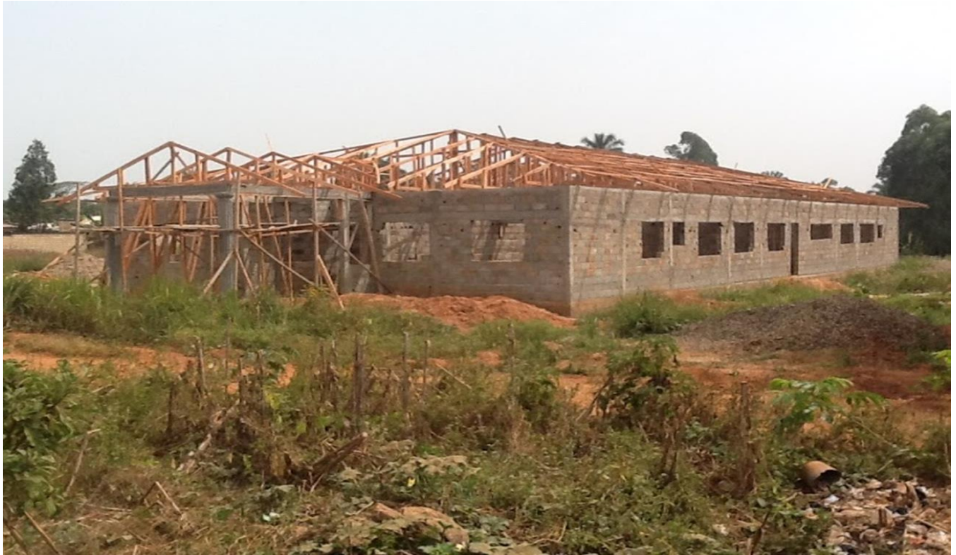
Primary Care Center Under Construction.

After the technical visit by the DMO of Ndop, a favorable technical report was written by the DMO to the Regional Delegate of Health for the Northwest Region, a formal application was submitted by the CEO on August 5, 2015 demanding the creation of Grace Gardens Hospital Ndop.