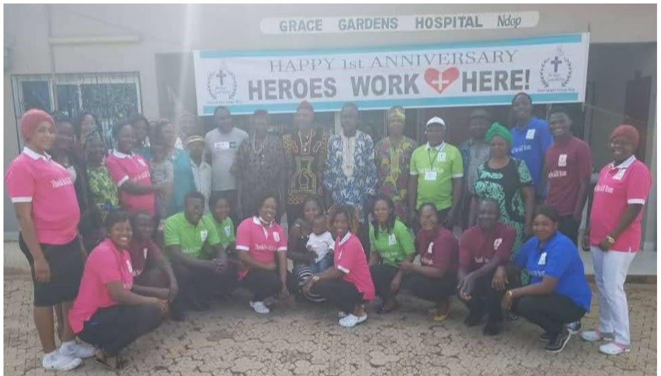
On November 26, 2020 GGH celebrated first anniversary