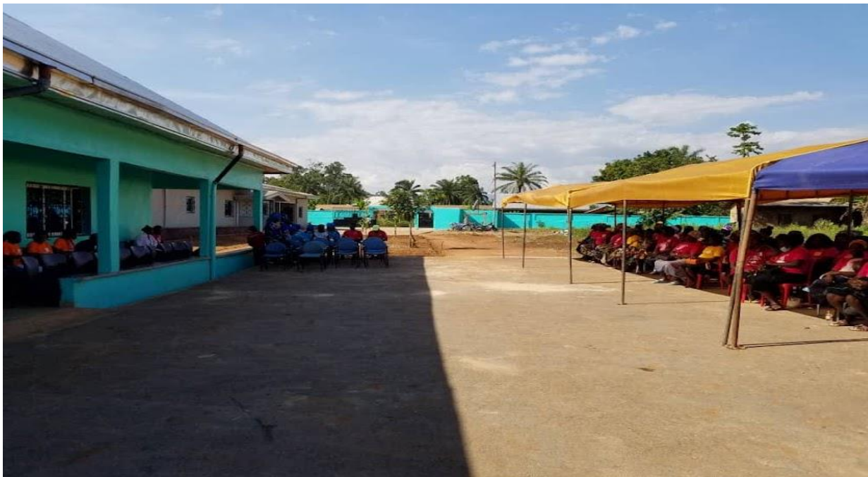
GGH second anniversary and inauguration of Surgical Center November 26, 2021