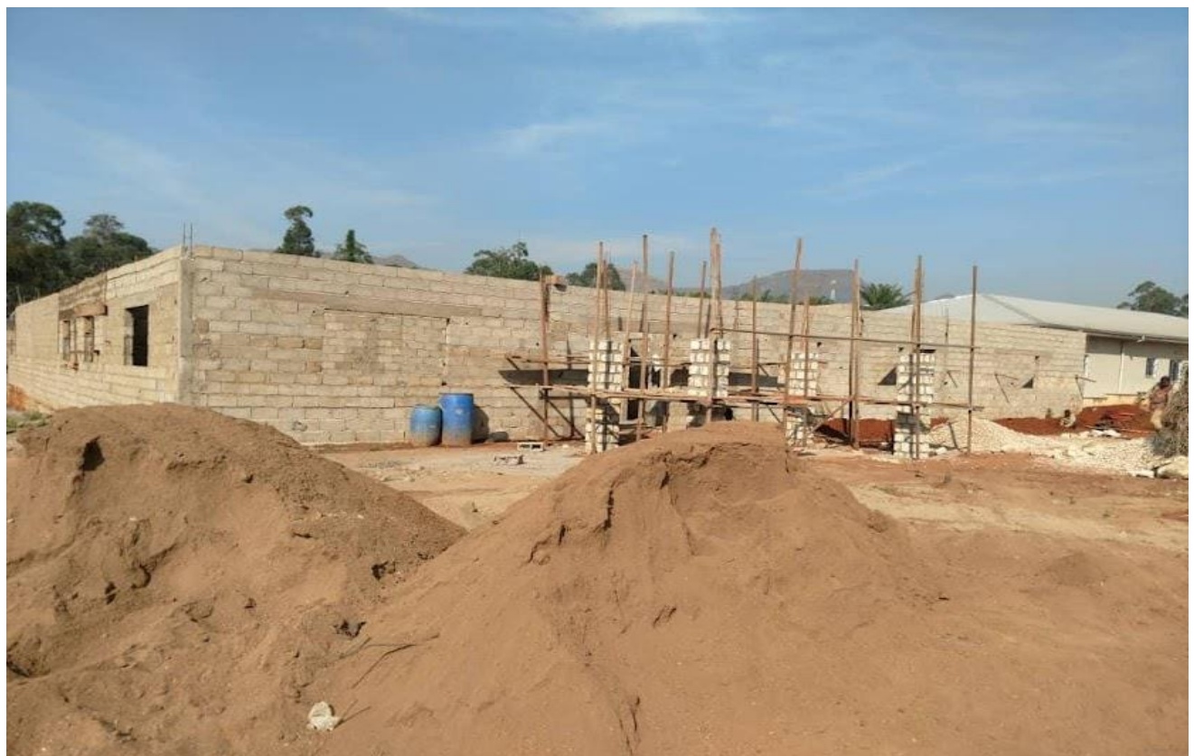
By November of 2020, the construction of GGH Surgical Center was almost complete.