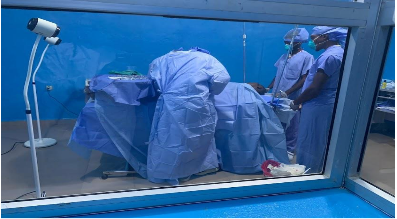
Surgery at the Surgical Center