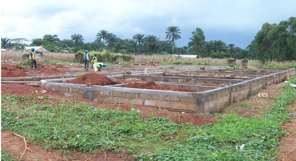
Foundation of the Primary Care Center