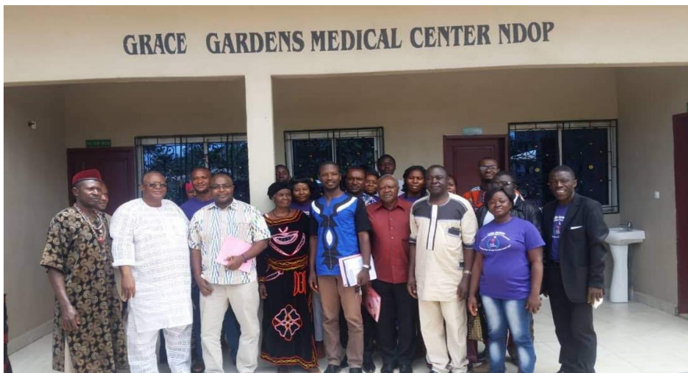
The President of the Northwest Medical Council posts after formal visit with local leaders, CEO's mother, and future staff of GGH on July 4, 2018.