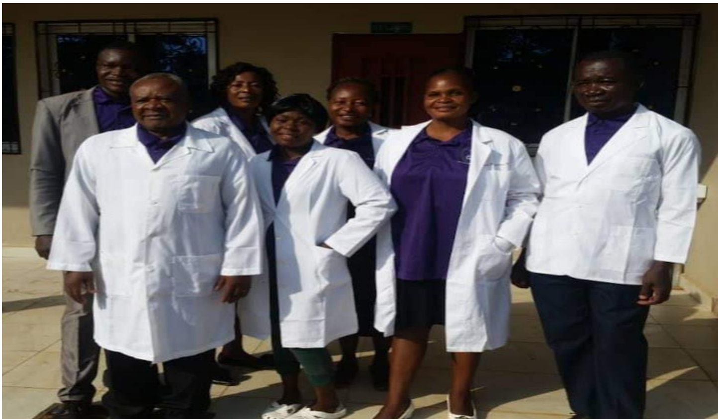
First Day of work at Grace Gardens on November 26, 2019.