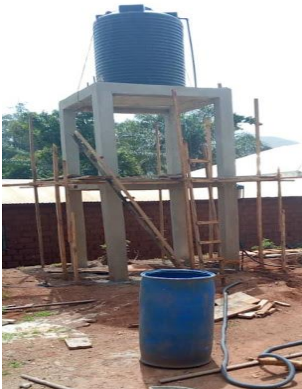
Construction of water tower complete in April 2020