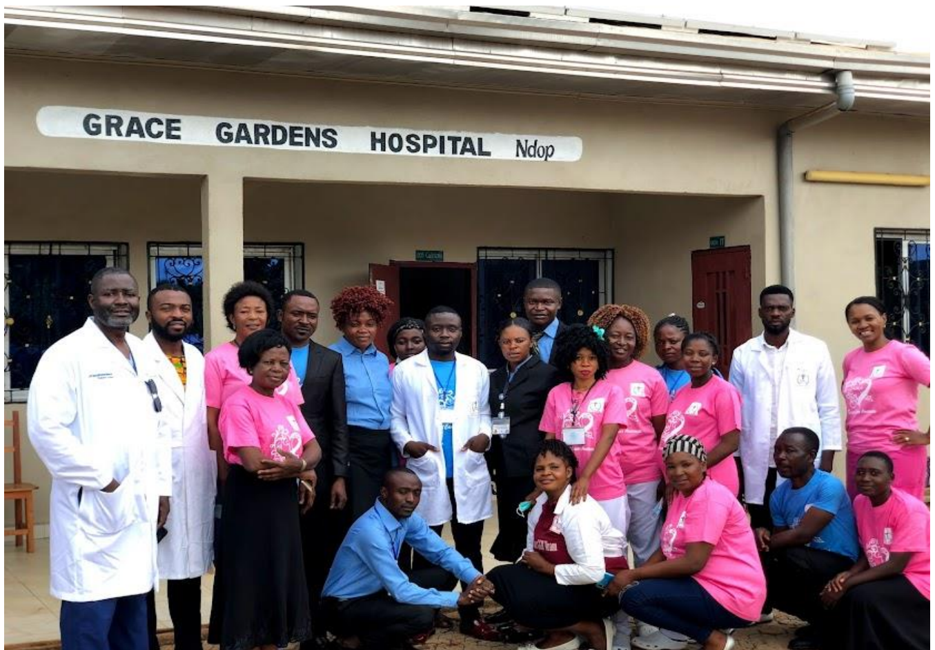
Staff of GGH posts with CEO (extreme left) and his wife (extreme right standing), July 2021