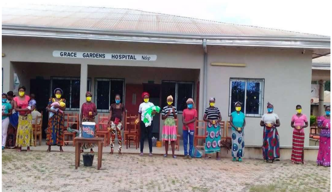
Women taught on how to use the masks and how to sanitize their hands.