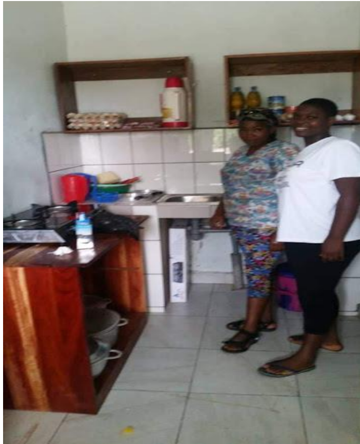
Grace Gardens Kitchen becomes functional in April 2020