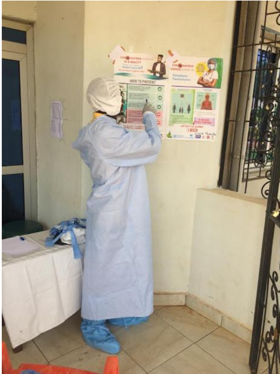
Preparing for COVID-19 in May of 2020.