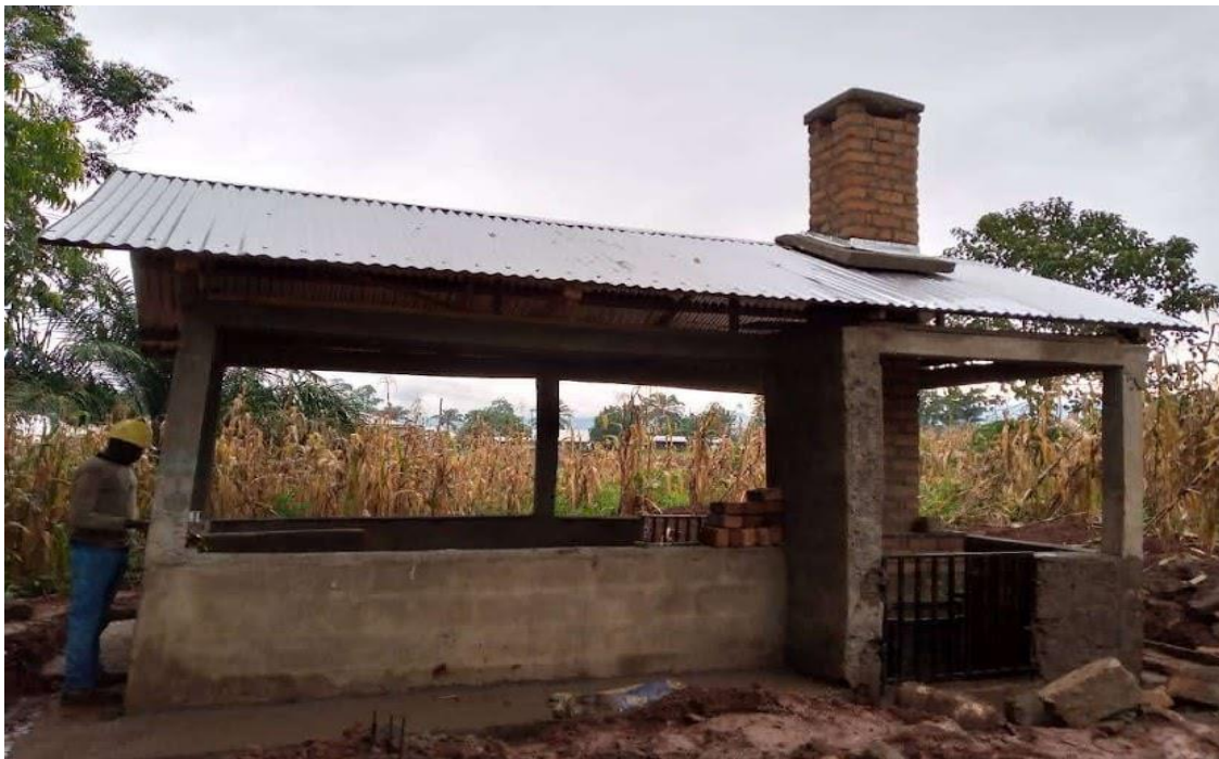
Successful completion of the incinerator in August 2020