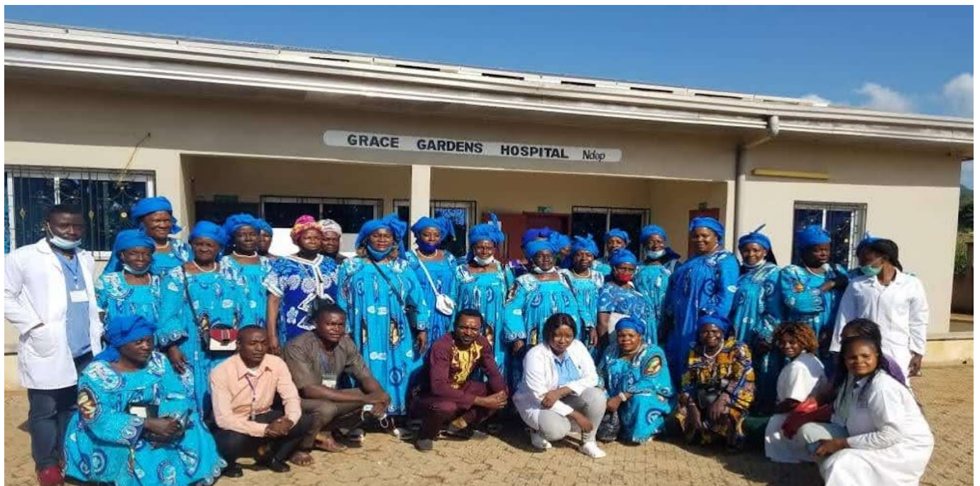
First Official visit to GGH by the Catholic Women in June 2020.