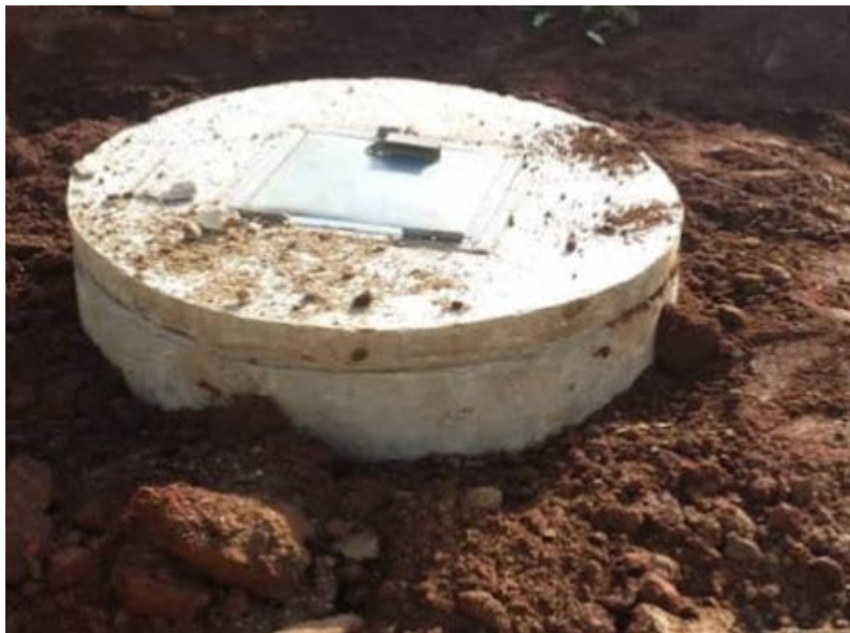
Construction of Grace Gardens well begin with digging of well, inserting cement rings closing it with a lid as shown here in April 2020.