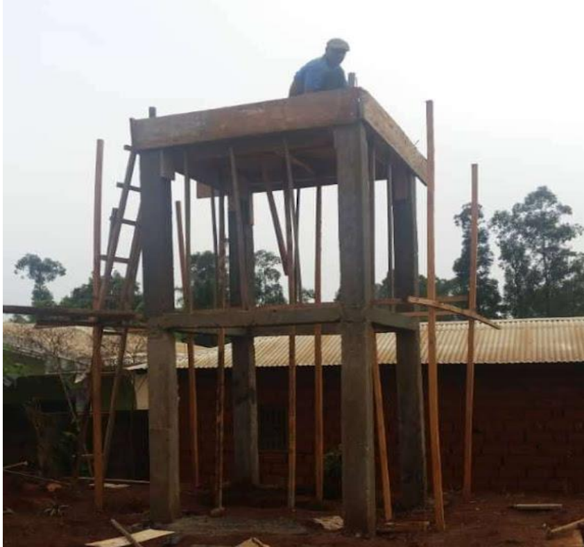
Construction of water tower in April 2020