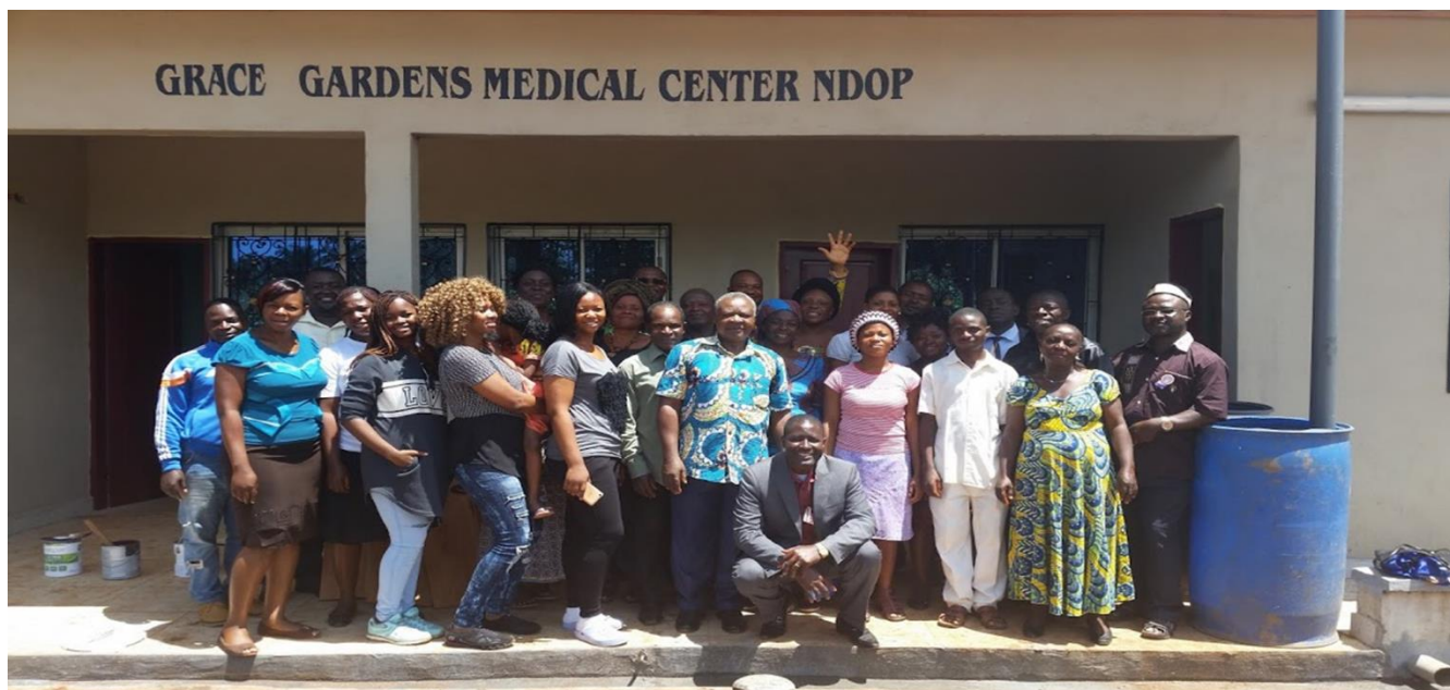
Prayer team and Grace Gardens Team post after prayer dedication of GGH Ndop on Friday June 9, 2017.