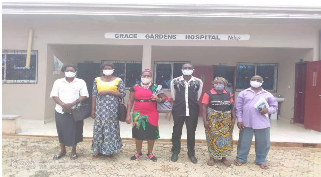
First group of Community healthcare worker established in August of 2020