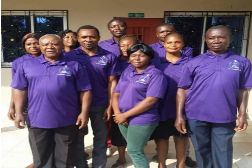
Pioneer Team of Employees post on November 26, 2019 after the opening ceremony.