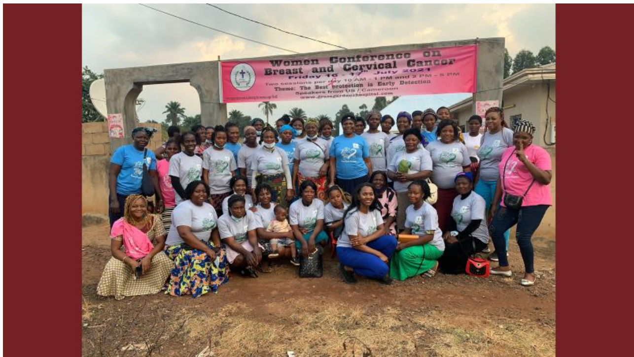
Women post after Cervical Cancer awareness, screening, and treatment of cancerous lesions at Grace Gardens in July 2021