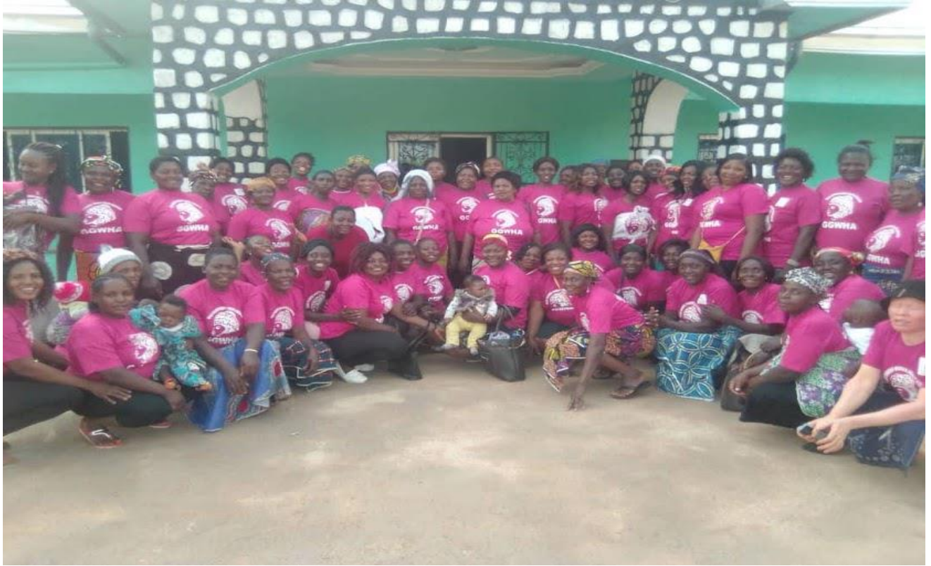
Another milestone of GGH was the formation of the Grace Gardens Women Health Association during the July 2021 Breast and Cervical Cancer screening and Treatment.