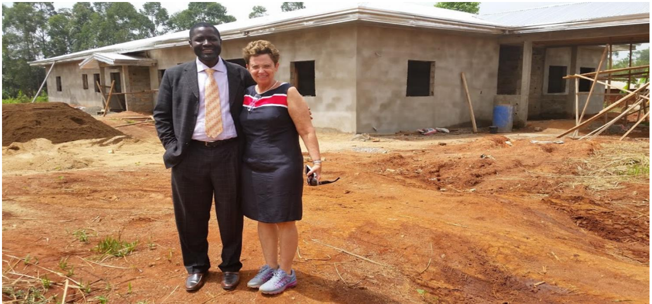
Project CURE Feasibility study at Grace Gardens in March 2016