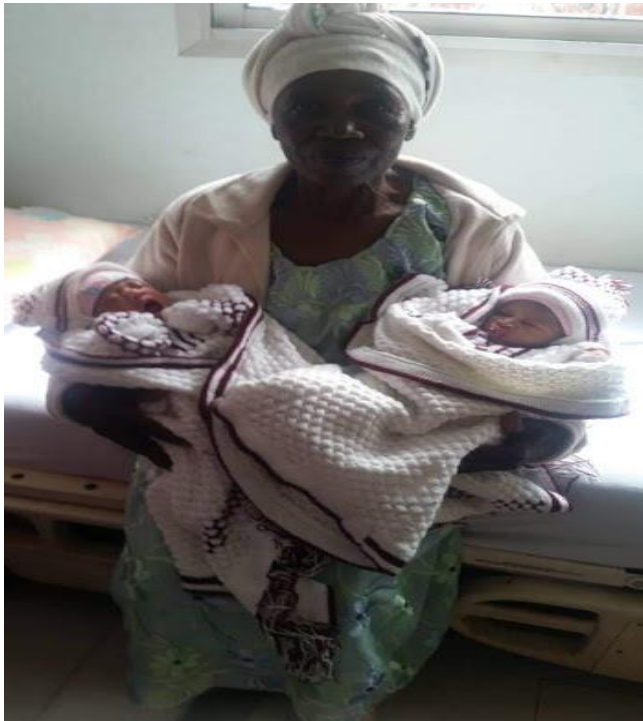
Twins delivered at Grace Gardens in March of 2020