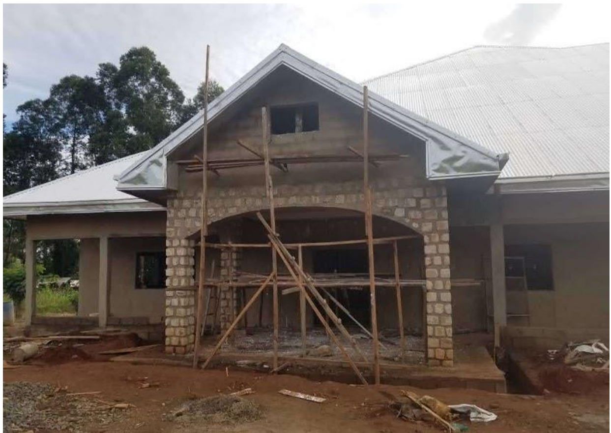
By May 2021, the surgical center had a roof, walls plastered and the floor concreted.