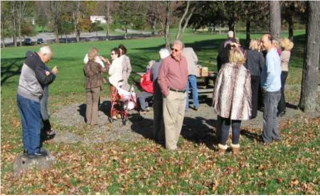
Coffee & Donuts