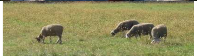
some of the locals