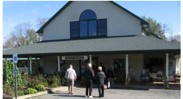
First stop - the sheep creamery