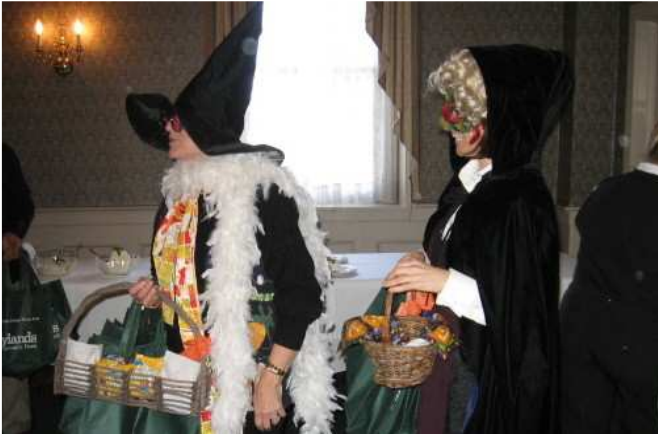
Who are those masked ladies handing out candy?