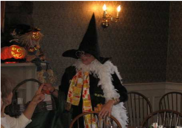
Don't you dare put a hex on me!!!