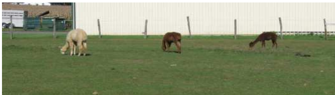
More locals? - looks like Alpacas from South America