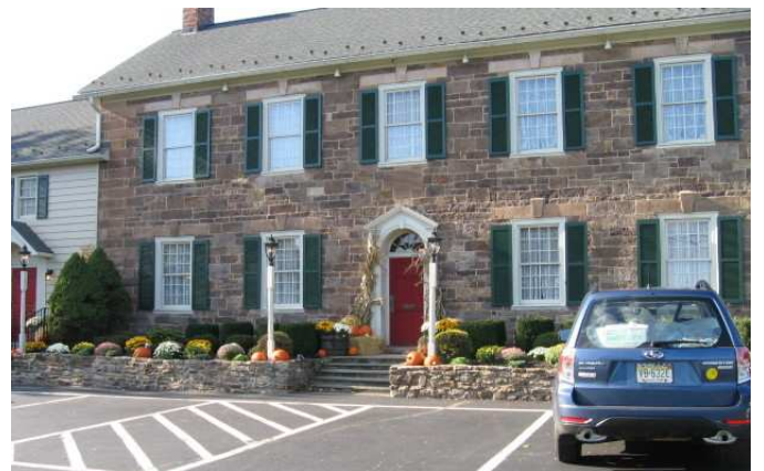
Last stop - Dinner time