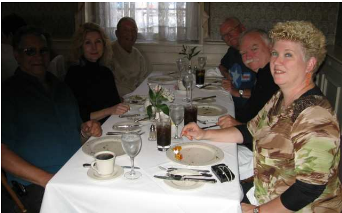
Sorry about the bad pics, must be the camera!!!