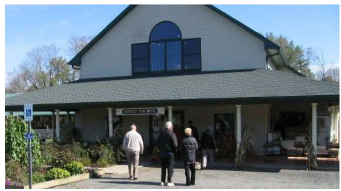
First stop - the sheep creamery