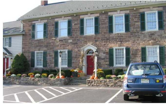
Last stop - Dinner time