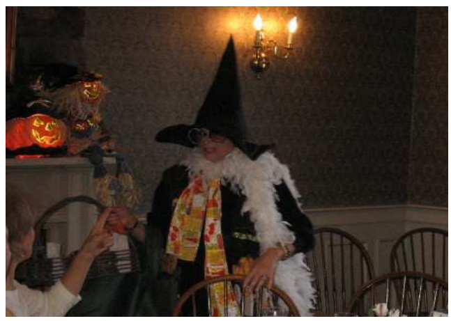
Don't you dare put a hex on me!!!