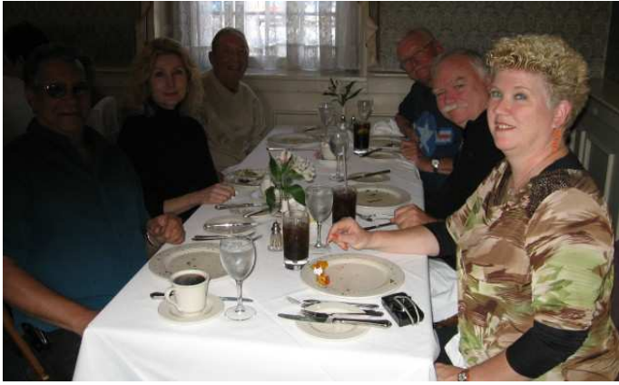
Sorry about the bad pics, must be the camera!!!