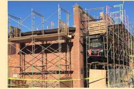
Masonry repointing of the NWIC Building is complete. VanWell Masonry, based in Snohomish, Washington, provides full-service masonry capabilities with a particular expertise in historic masonry repair and restoration. Their skilled craft work will ensure that the NWIC Building will stand the test of time.