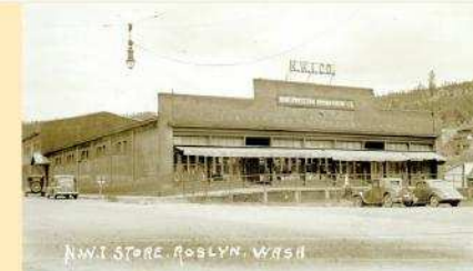
"Northwestern Improvement Company Store" (1935).