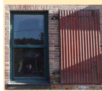
Legacy Renovation, experts in historic window restoration, is carefully rebuilding and repainting the wood windows in the NWIC Building. Work is expected to be complete by the end of November.