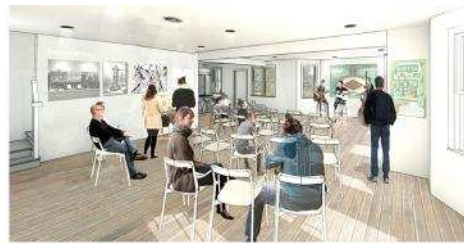
Open classroom and exhibit space with movable tables and chairs provides a flexible gathering place for learning, display and creative activities.

After sitting vacant for several years, the RDA acquired the property in 2010. Volunteers cleared debris from the house and yard and installed temporary windows to help preserve the structure. Public engagement efforts to realize this significant project date back to 2011, when the RDA invited the UW Storefront Studio explored and presented a range of ideas for reuse. In 2016, the RDA organized a visioning workshop that helped shape numerous ideas for the Center. SHKS Architects developed the design to retain the building's historic character while adapting it for creative activities and programs.