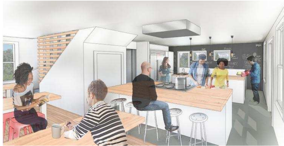
A demonstration kitchen provides a place to celebrate and share Roslyn's rich ethnic culinary traditions.