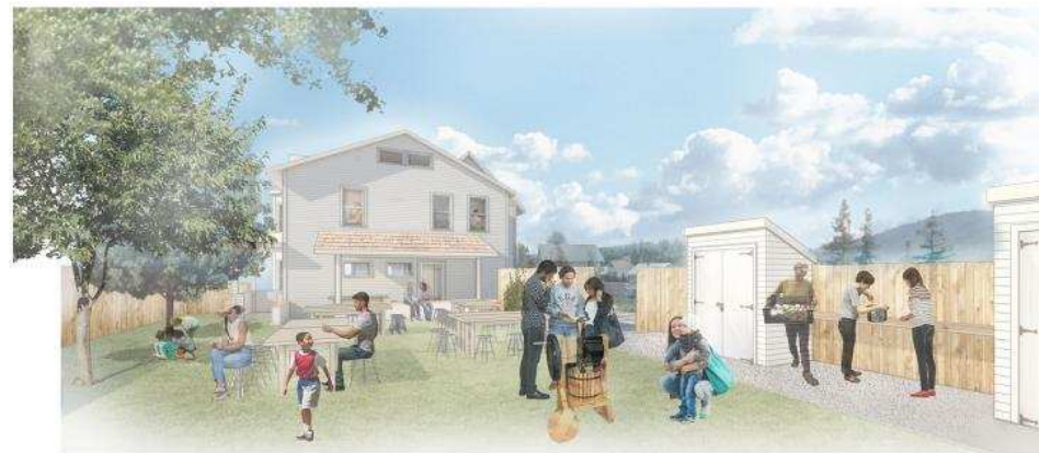
A covered porch, tool sheds and sturdy furniture transforms the backyard into a place for creative outdoor activities and events.