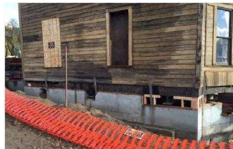
The Roslyn Creative Center is safely back on the ground, resting on a new concrete foundation.